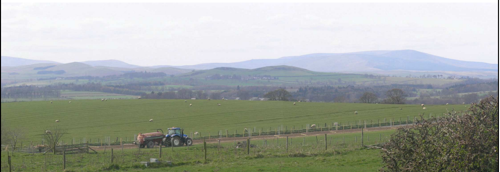
Above: Glanton and the Cheviot Hills from Abberwick Farm