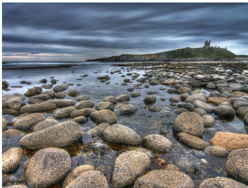
Above: beautiful shot of Dunstanburgh Castle published in the newsletter this time last year