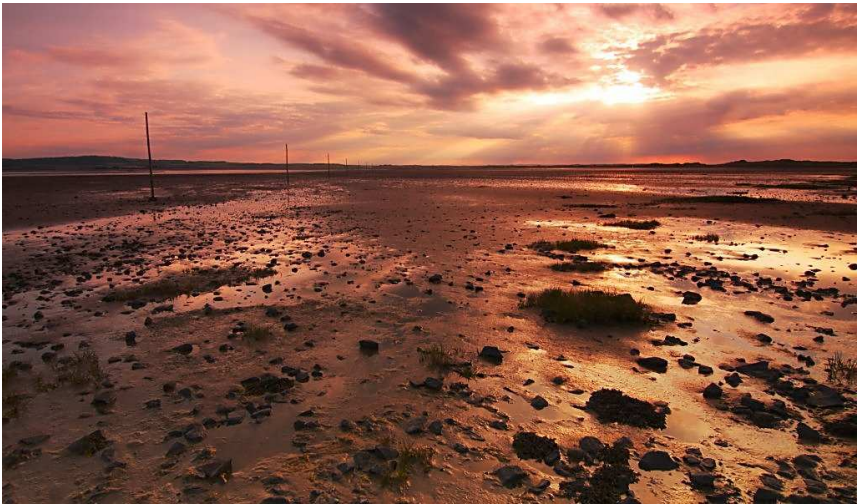
Pilgrims' Sunset

It's not the equipment that makes the photograph; it's the photographer. Whilst the quality of equipment that you use to capture an image can affect the presentation of an image, the real magic behind a photograph is having a "seeing eye" - observing something and realising that it has the potential to be photographed and make an image which will have an effect on those who view it.