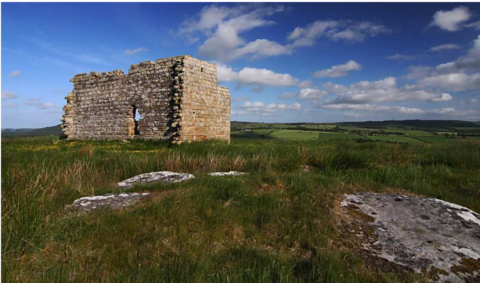
Jenny's Lantern

The "Personal Views" exhibition will be on display at Woodhorn Colliery from the afternoon of Saturday 23rd April until Sunday 3rd July. I'd like to invite you to come along - I'm sure that there will be plenty there for you to enjoy.