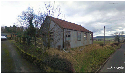
Figure 1: Before

We do hope that what we have done has enhanced the village in some way and that the objections have been answered positively.