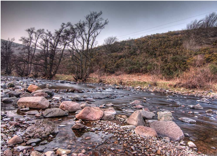
River Breamish, Ingram Valley

Photography isn't just about the photographs. Yes, I've gone on trips and got some photographs that I'm very pleased with, but there were also some occasions where I remember the location, or the company, or something else, more than any particular pictures that I took.