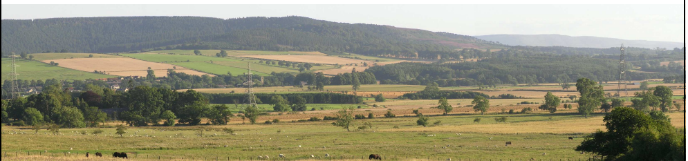
Above: Thrunton Woods and the Simonsides in the distance from the South side of the village