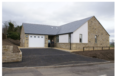
Figure 2: After