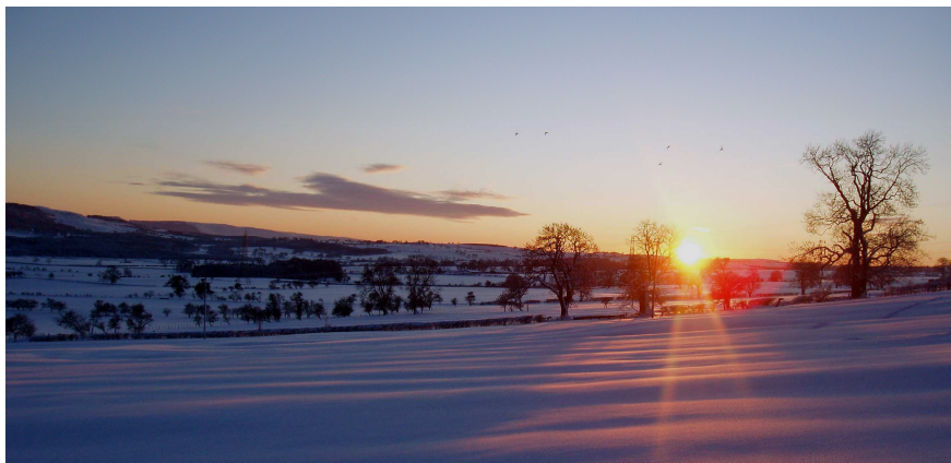
Above: A snowy sunset taken from one of "the sledging fields"